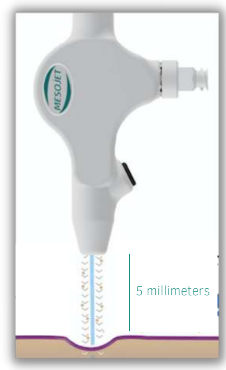
5 millimeters from skin surface targets the optimal penetration

The use of the Franz diffusion cell method for the evaluation of percutaneous absorption of substances in order to predict their behavior in vivo is consolidated and supported by a large literature in cases where the stratum corneum is the main barrier that limits dermal and transdermal absorption. The test performance methods are reported in the "GUIDANCE DOCUMENT FOR THE CONDUCT OF SKIN ABSORPTION STUDIES, OECD SERIES ON TESTING AND ASSESSMENT, Number 28" (2, 3). As regards the choice of the diffusion membrane, pig skin is indicated in the literature as the most appropriate alternative to human skin for predicting absorption in vivo. The exposure time was set at 5 hours.